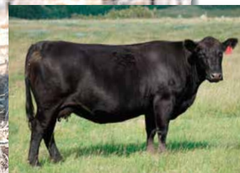
Dam - Rivercrest Daisy 60C

Dam 60C: 4 males Avg BW: 89 lbs WW Ratio 95 2 females Avg BW: 84 lbs WW Ratio 108