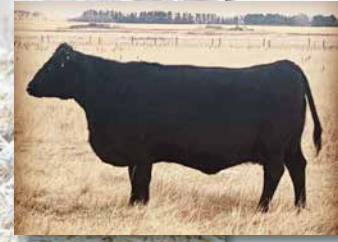
Dam - River Valley Lady 11B