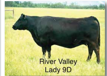
River Valley Lady 9D