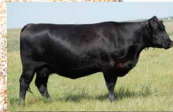
Dam - Rivercrest Blackcap CSP 20B

Dam 20B: 4 males Avg BW 81 lbs WW Ratio 105 3 females Avg BW 75 lbs WW Ratio 105