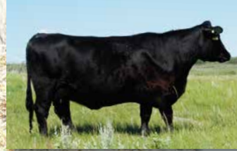
Dam - Rivercrest Flora 87F

Dam 87F: 3 males Avg BW 74 lbs WW Ratio 101