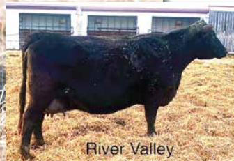
Dam - River Valley Lady 2E